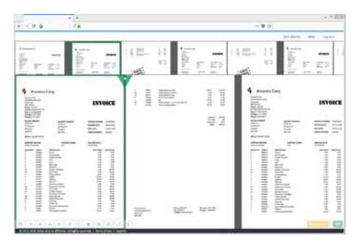
Page separation service - this shows how an operator can quickly separate individual documents where multiple invoices have been included in the same PDF file.